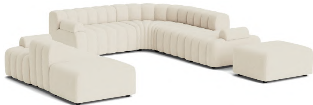
Studio Setup 5 1x Studio Small / 1x Studio Medium / 1x Studio Large / 1x Studio Corner / 2x Studio Ottoman / 2x Studio Ottoman Classic / 3x Studio Armrest