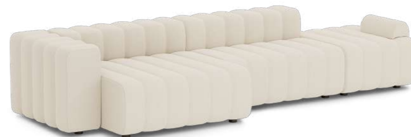
Studio Setup 12 1x Studio Lounge Large Armrest Short Right / 1x Studio Large / 1x Studio Ottoman / 1x Studio Armrest