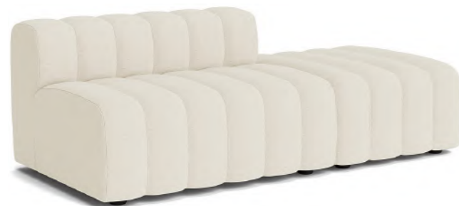
Studio Setup 6 1x Studio Large / 1x Studio Ottoman