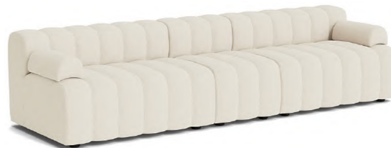
Studio Setup 3 2x Studio Large / 1x Studio Small / 2x Studio Armrest