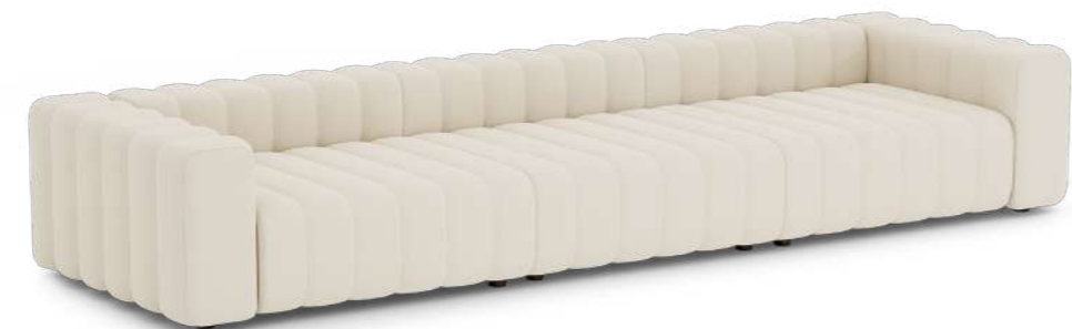
Studio Setup 10 1x Studio Lounge Large Armrest Right / 1x Studio Lounge Large / 1x Studio Lounge Large Armrest Left