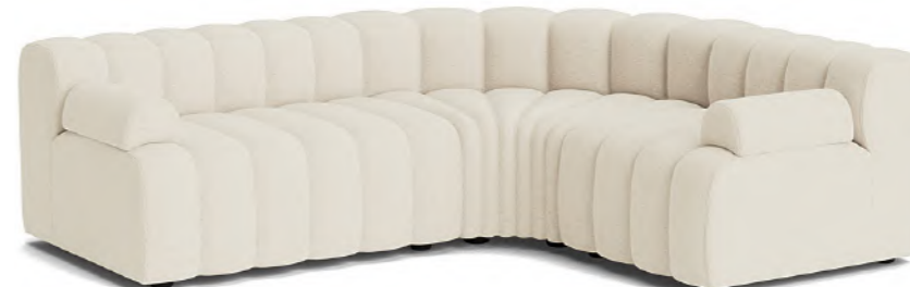
Studio Setup 4 1x Studio Medium / 1x Studio Large / 1x Studio Corner / 2x Studio Armrest