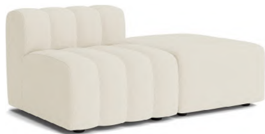
Studio Setup 2 1x Studio Medium / 1x Studio Ottoman Classic