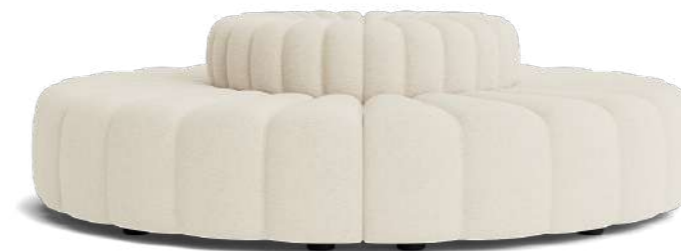
Studio Setup 7 4x Studio Curve