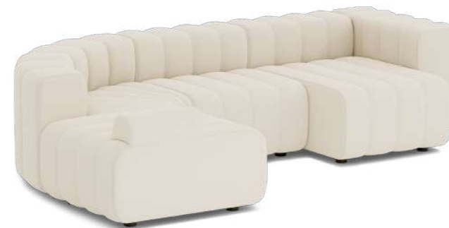
Studio Setup 11 1x Studio Lounge Medium Armrest Short Left / 1x Studio Medium / 1x Studio Corner / 1x Studio Ottoman / 1x Studio Armrest