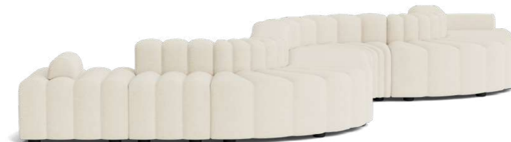
Studio Setup 8 1x Studio Small / 1x Studio Medium / 1x Studio Large / 2x Studio Curve / 1x Studio Corner / 1x Studio Ottoman / 2x Studio Armrest