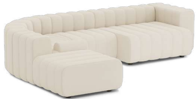
Studio Setup 9 1x Studio Lounge Large Armrest Short Left / 1x Studio Small / 1x Studio Medium / 1x Studio Corner / 1x Studio Ottoman / 1x Studio Armrest