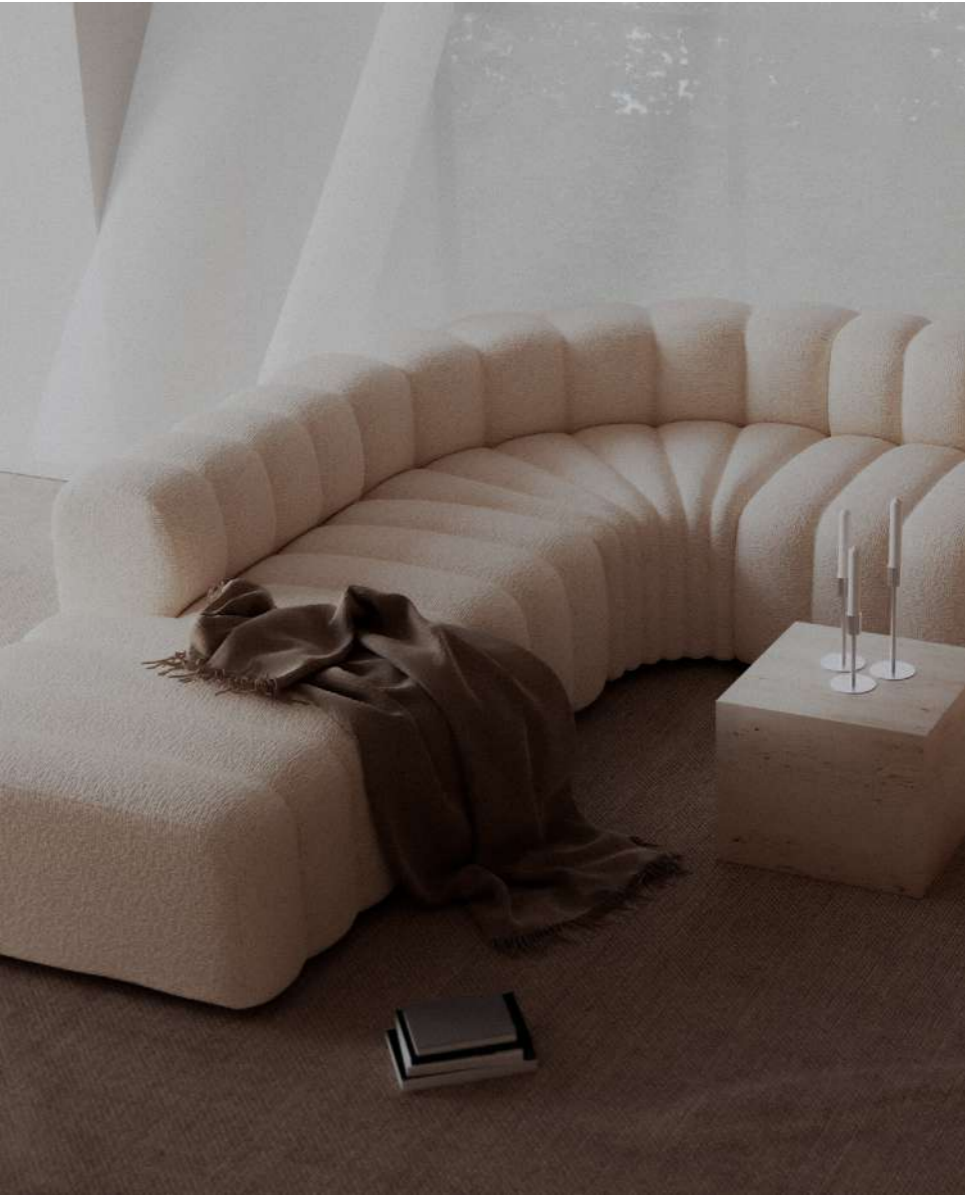
Left: Studio Lounge Sofa, Barnum Bouclé Col 24 / Cubism Small, Travertine Stone / Hippo Bar Chair, Barnum Bouclé Col 24, Natural Oak / Gallery Wall Lamp / Gallery Pendant Right: Studio Lounge Sofa, Barnum Bouclé Col 24 / Cubism Small, Travertine Stone