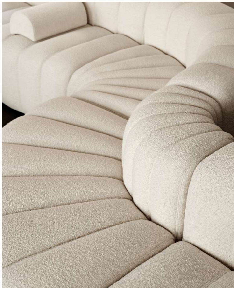
Studio Sofa, Barnum Bouclé Col 24