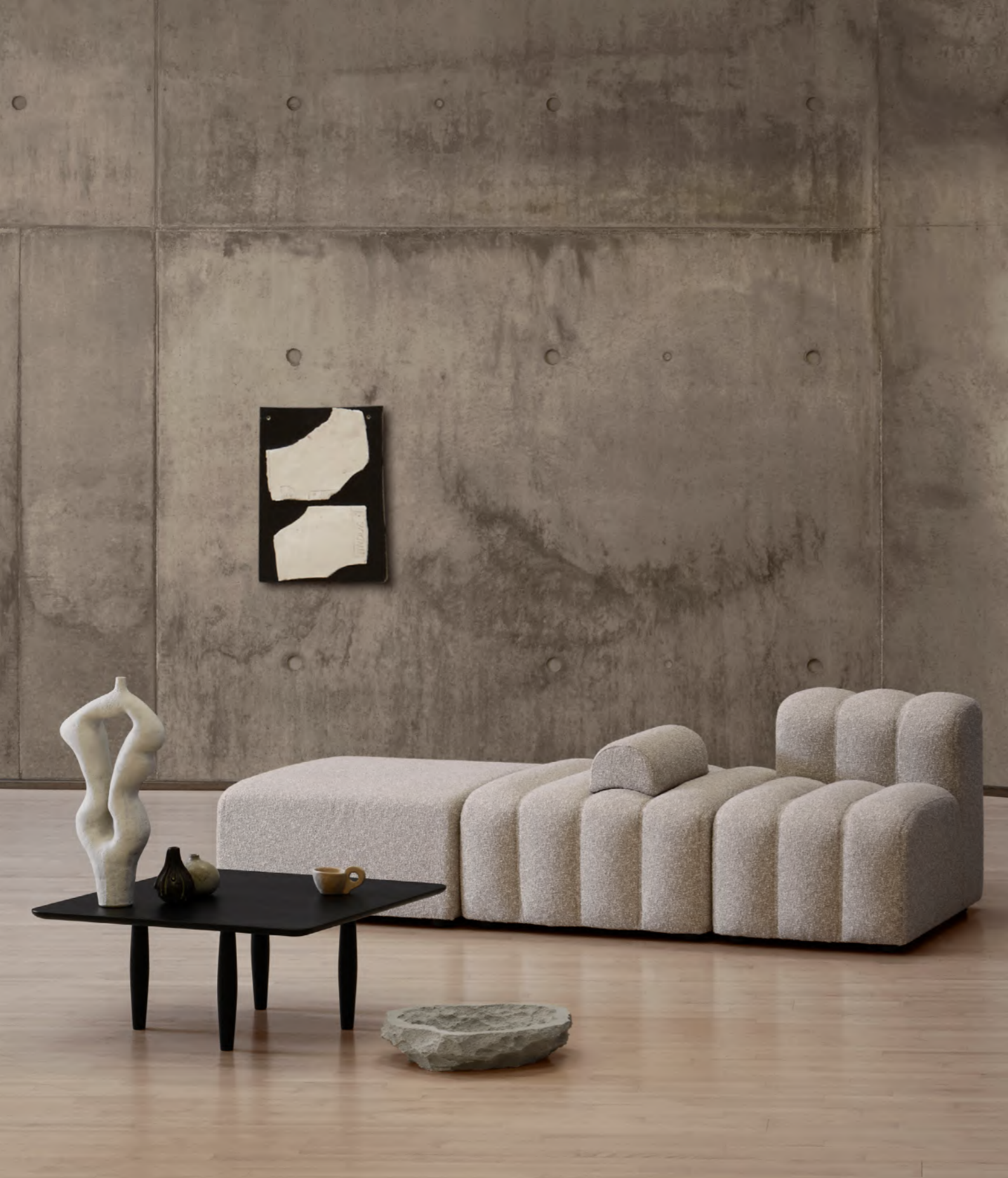
Left: Studio Sofa, Sahco Zero 0012 / Oku Coffee Table, Black Oak Top: Studio Sofa, Barnum Bouclé Col 24 Bottom: Studio Sofa, Barnum Bouclé Col 24